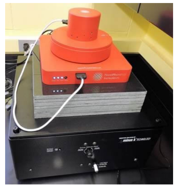
ezAFM+ supported by Negative-Stiffness vibration isolation.

Since the release of the first commercial atomic force microscope (AFM) about 30 years ago, technology advances have steadily been implemented to improve their performance. Now, the most recent advance in ambient-temperature AFMs is making them more compact, portable and user-friendly, which is enabled by Negative-Stiffness vibration isolation.