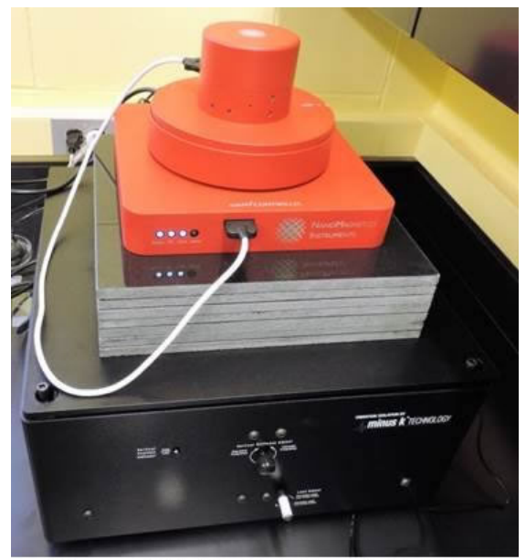
ezAFM+ supported by Negative-Stiffness vibration isolation.

Since the release of the first commercial atomic force microscope (AFM) about 30 years ago, technology advances have steadily been implemented to improve their performance. Now, the most recent advance in ambient-temperature AFMs is making them more compact, portable and user-friendly, which is enabled by Negative-Stiffness vibration isolation.