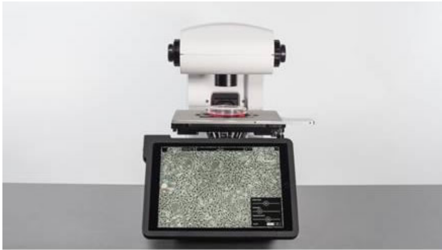
Revolve combines the full functionality of both upright and inverted microscopes.