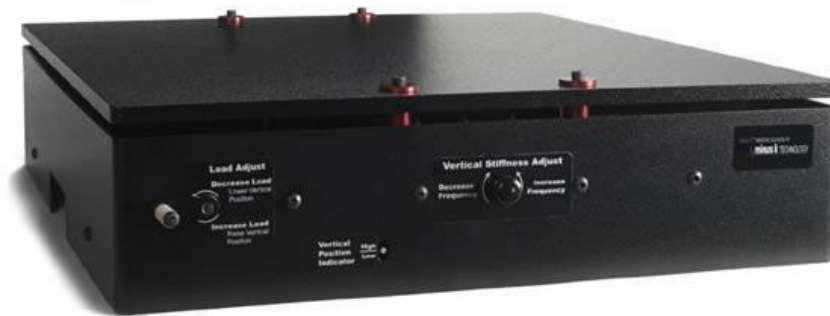
Minus K BM-8 Negative-Stiffness vibration isolator.

Because of its very high isolation efficiencies with low-hertz vibrations in both vertical and horizontal vectors, Negative-Stiffness vibration isolation enables sensitive instruments, like Revolve, to be located wherever a production facility or laboratory needs to be set up, whether that be in a basement, or on a building’s vibration-compromised upper floors.