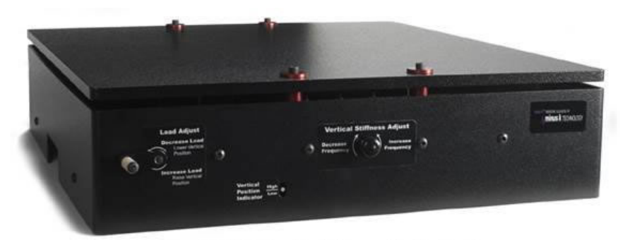
Minus K BM-8 Negative-Stiffness vibration isolator.

Because of its very high isolation efficiencies with low-hertz vibrations in both vertical and horizontal vectors, Negative-Stiffness vibration isolation enables sensitive instruments, like Revolve, to be located wherever a production facility or laboratory needs to be set up, whether that be in a basement, or on a building's vibrationcompromised upper floors.