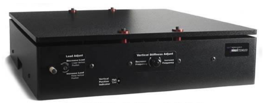
Minus K BM-8 Negative-Stiffness vibration isolator.

Because of its very high isolation efficiencies with low-hertz vibrations in both vertical and horizontal vectors, Negative-Stiffness vibration isolation enables sensitive instruments, like Revolve, to be located wherever a production facility or laboratory needs to be set up, whether that be in a basement, or on a building's vibration-compromised upper floors.