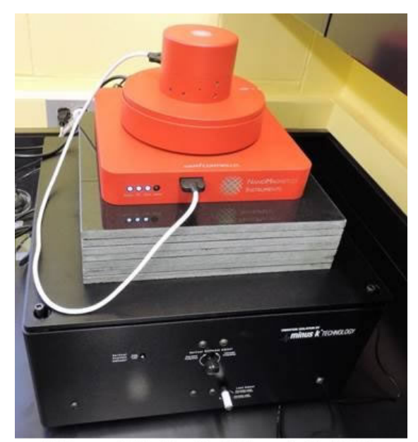
ezAFM+ supported by Negative-Stiffness vibration isolation.

Since the release of the first commercial atomic force microscope (AFM) about 30 years ago, technology advances have steadily been implemented to improve their performance. Now, the most recent advance in ambient-temperature AFMs is making them more compact, portable and user-friendly, which is enabled by Negative-Stiffness vibration isolation.