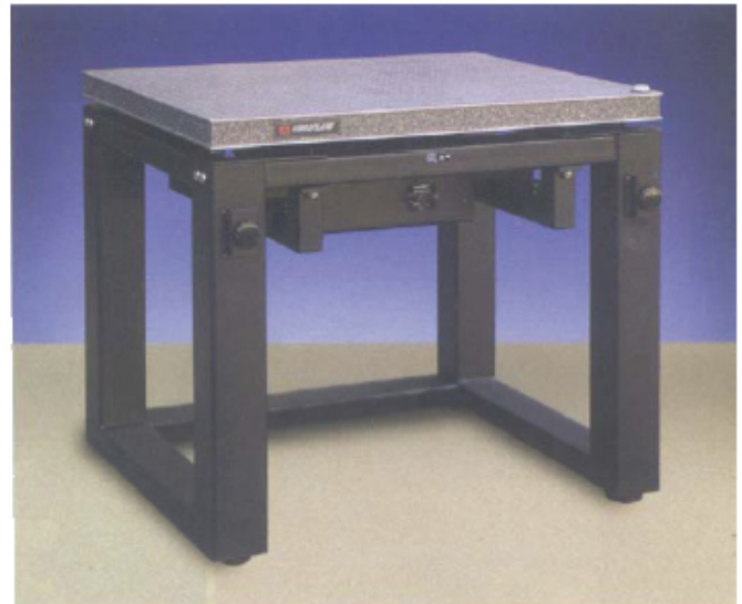
Steady work: The MK26 workstation, a joint product from two vibration-isolation companies, is designed to cancel very low-frequency vibration—about 99 percent of a 5 Hz interference.

As Minus K describes it, its vibration damping system uses a spring that supports a load in concert with a negative-stiffness mechanism to cancel vertical vibra-