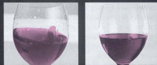
Without Minus K