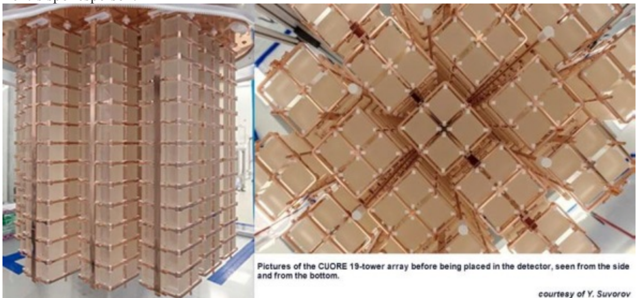
Pictures of the CUORE 19-tower array before being placed in the detector, seen from the side and from the bottom.

The installation of 19 “towers” that make up the detector was completed near the end of August 2016. “All of the 19 towers that make up the detector, consisting of 988 Tellurium oxide crystals and weighing nearly 750 kg (1650 lbs), are now suspended from the coldest point of the experiment cryostat,” said Oliviero Cremonesi, the experiment’s spokesperson.