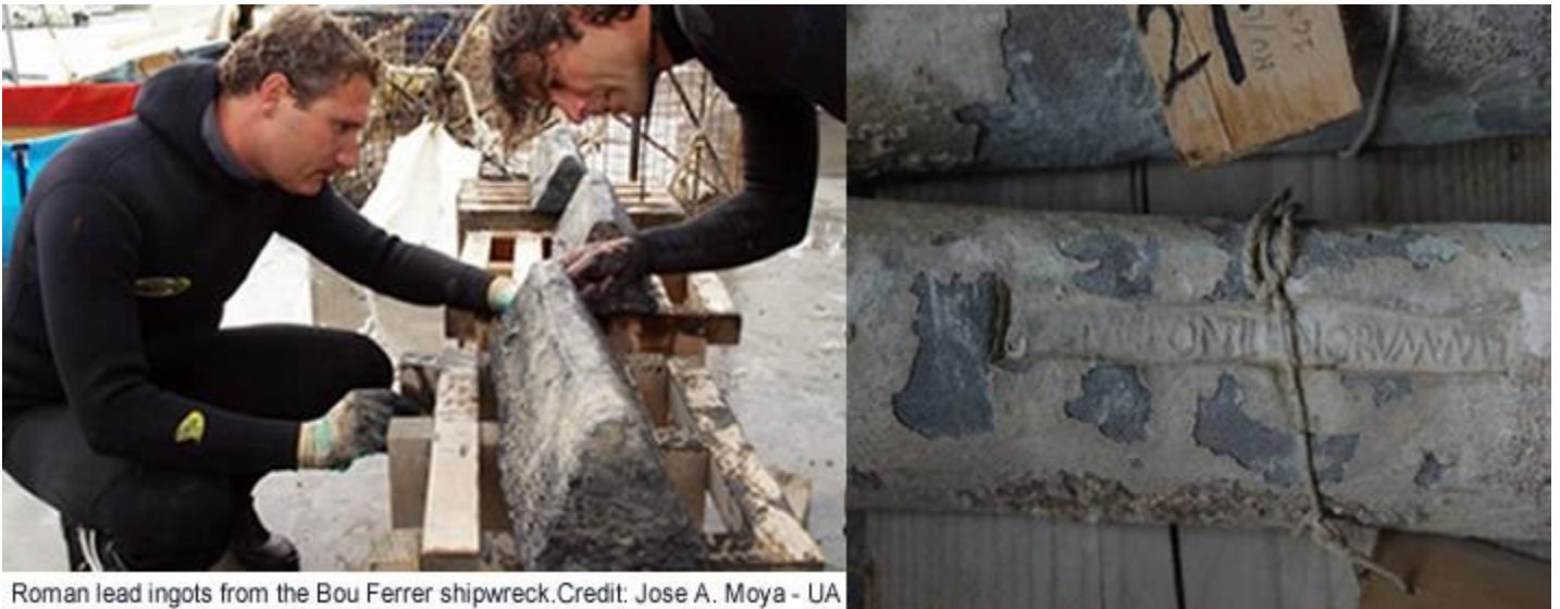
Roman lead ingots from the Bou Ferrer shipwreck.

The Roman lead is pure, dense and much less radioactive, almost all of the lead-210 has already decayed. The ingots that sat at the bottom of the sea for two millennia have been spared cosmic bombardment and provide very clean, if somewhat exotic, shielding material which is ideal for shielding sensitive experiments that hunt for dark matter and other rare particles.