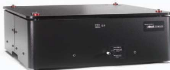
Model BM-4 Negative-Stiffness vibration isolation system.

Testing has shown how harmonic amplitudes in nonlinear spectroscopy with the ACSTM can be interpreted in