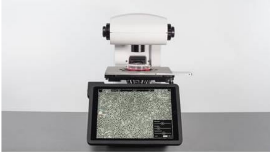
Revolve combines the full functionality of both upright and inverted microscopes.