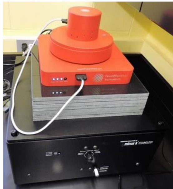
ezAFM+ supported by Negative-Stiffness vibration isolation.

Since the release of the first commercial atomic force microscope (AFM) about 30 years ago, technology advances have steadily been implemented to improve their performance. Now, the most recent advance in ambient-temperature AFMs is making them more compact, portable and user-friendly, which is enabled by Negative-Stiffness vibration isolation.