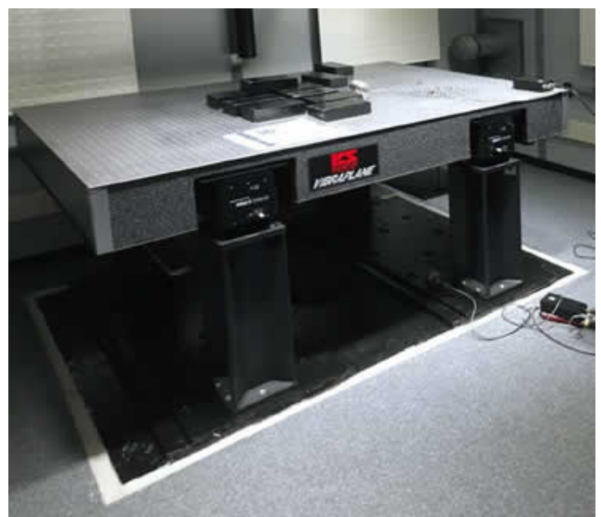
Customized Minus K Technology Negative-Stiffness vibration isolation table installed in the Ultra-Low Vibration Lab

For each material, they designated one sample (the planar substrate) that would be heated to 305° F. Using a probe, they coated the tip with the same material, but kept it connected at the base to a thermal reservoir that was maintained at a cooler 98° F. The sample and the probe were slowly moved, together, in small steps, beginning at 50 nanometers until they were touching. The temperature of the tip was measured at regular distances (gaps) between 2 nm and 50 nm. The cause of the rapid heat transfer, the researchers discovered, was the result of an overlap of the two sides' surfaces, and evanescent waves, both of which carry heat. A phenomenon present in nanoscale gaps.